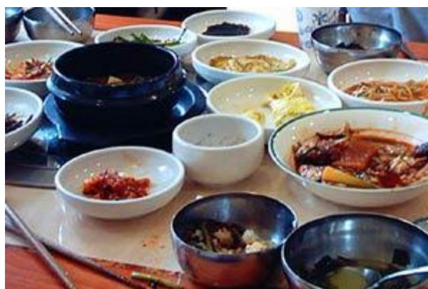
Being a dishwasher is not a nice job here!

Westerners, if it's a group of friends, will usually go out for supper and then split the bill in some manner, whether it's everyone throwing in ten bucks or a to-the-penny calculation. If you go out with your class or with a student in Korea they will usually insist on paying. If you go out with them often you should sneak away to pay for everything sometimes. The students will make a theatrical show of protest, but they will appreciate you doing so. It is a delicate social nuance you should learn so that no one feels you are becoming a freeloader.