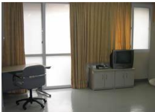
My old apartment

Apartments are usually quoted in pyeong , which is a measurement of area squared. One pyeong is 36 sq. ft. or 3.1 square metres. A liveable apartment, even for two, is 14-20 pyeong . 10-14 is a little tight but okay. Any less is ridiculous, and may be a dorm room. Avoid a dorm anyway; you don't want to live next door to other students who will get drunk and watch soccer at three in the morning. And if you're offered 25 or more pyeong , e-mail me so that I can apply for the job! :->