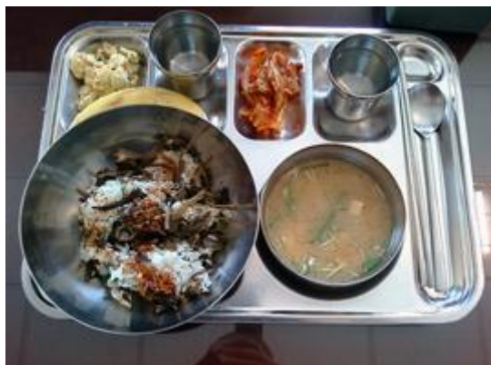
You can go out to a restaurant, or your stomach can develop a sense of humor.

pizza). There are some things which Koreans generally dislike the taste of, such as mint and root beer, and these will be next to impossible to find. I've never met an ESL teacher who didn't like Mexican food, and sadly it's almost unobtainable here. This may change. I notice that suddenly taco chips are all the rage as bar snacks.