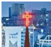
Church in Korea