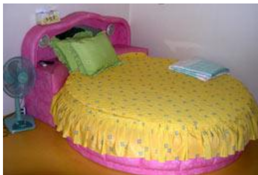
A love hotel room, for extra-klassy customers. Jacuzzi rooms on request! I haven't seen a mirrored ceiling yet, but they probably exist.

One of the unfortunate drawbacks for international tourists in Korea is that there are few actual hotels in the country other than the pricey high-end ones in major cities. You will never see a mention of love hotels in tourist brochures or websites because, of course, they don't exist— all Koreans are sexually chaste and only foreigners have extramarital affairs. You will have to trust my word that there are plenty of love hotels and that if you trust your instincts, some of them are very clean and surprisingly well-appointed with entertainment systems and whirlpools.